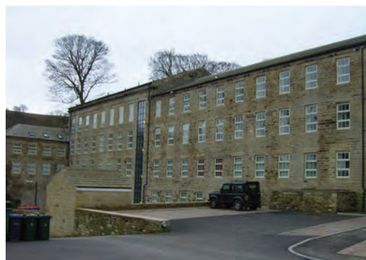
Woodlands Mill, Steeton