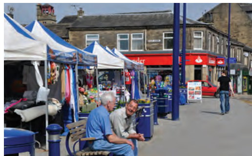
Top: Keighley Campus Above: Bingley