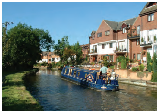
The Leeds and Liverpool Canal at Siltsden

Steeton with Eastburn is a settlement full of character with Airedale Hospital providing an excellent range of employment opportunities. It has seen high quality housing and commercial led mixed use developments that have assisted in providing safe and attractive pedestrian and cycle links to Siltsden and Steeton railway station with its fast and frequent train services to employment and retail centres of Keighley, Skipton and Regional Cities of Bradford and Leeds.